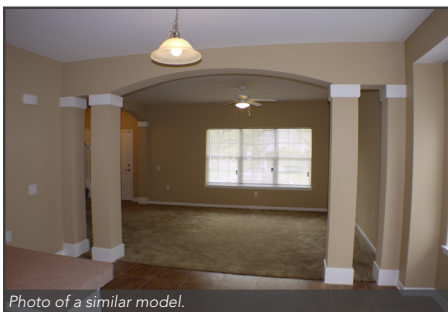
Photo of a similar model.