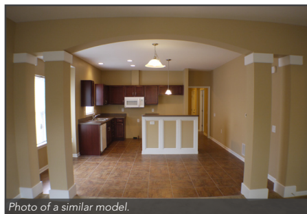
Photo of a similar model.