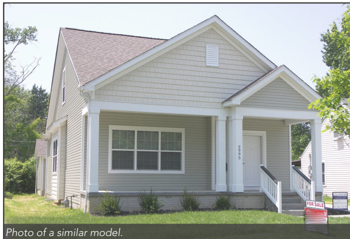
Photo of a similar model.