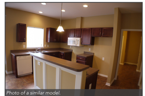
Photo of a similar model.

The drawings and written material appearing herein constitute an original and unpublished work of Homeport and the same may not be duplicated, used or disclosed without the written consent of Homeport. Homeport reserves the right to change, revise, delete and/or substitute product features, dimensions, specifications, architectural details and designs without notice. This brochure is not a legal document and is for illustration purposes only.